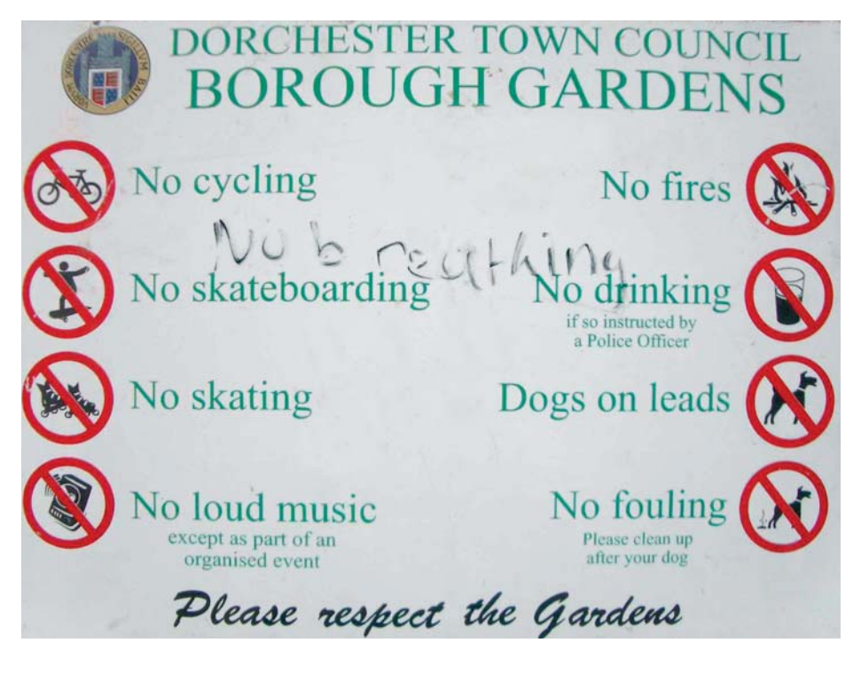
Each prohibition on this sign may be defensible, however, the broader message is hard to avoid – as the graffiti addition makes clear.

intervention to minimise risk at the expense of childhood experience. Adult anxieties typically focus on children's vulnerability, but they can also portray children as villains, again recasting normal childhood experiences as something more sinister.